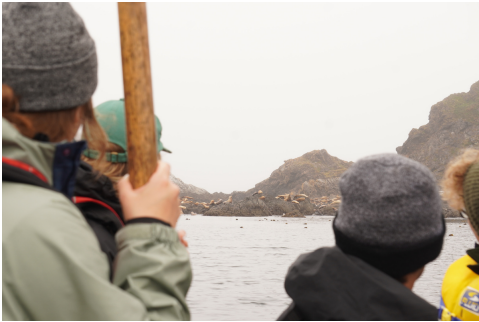
Watching sea lions at Triangle Island (above), and a zoomed in shot of one watching us too (below)!