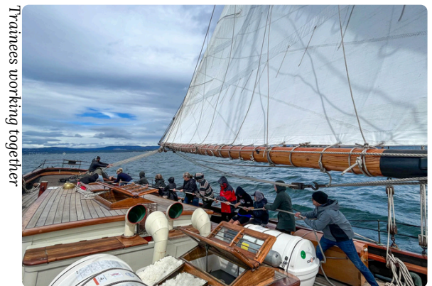
Trainees working together

Thank you to those who made donations in 2023 towards new bursary funding: the John Russell Cooper Memorial Bursary Fund through the Victoria Foundation, the Laughton Charitable Trust, those who made new contributions to the Keith McKeown Bursary Fund, those who made new contributions to the William H. Cairns Bursary Fund, and the many individuals who specifically directed their gift towards bursary funding. We are also deeply grateful to those whose donations in past years continue to provide young people with life-changing SALTS trips each year.