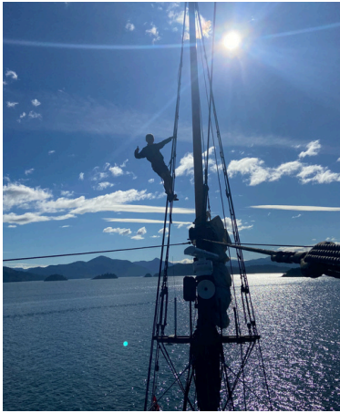
Trainee enjoying the view from aloft

Each year, generous donors provide thousands of dollars in bursary funds that allow young people—who would not otherwise be able—to participate in a SALTS trip. In 2023, the SALTS bursary program provided a total of $167,636 in trip funds, which supported 41 individuals in our summer program and 82 individuals in our group program.