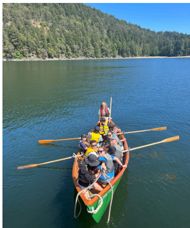
Trainees rowing a dory

Each year, generous donors provide thousands of dollars in bursary funds that allow young people—who would not otherwise be able—to participate in a SALTS trip. In 2024, the SALTS bursary program provided a total of $74,270 in trip funds, which supported 36 individuals in our summer program and 2 individuals in our group program.