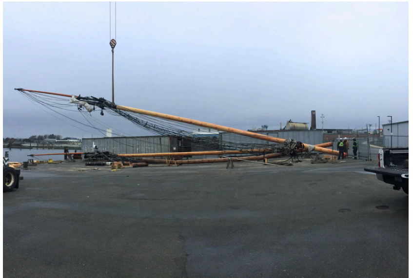
Installing the Pacific Grace's new mast

Maintenance in our shop and on our ships in 2024 involved many small repair projects, the finishing and install of a new mast for the Pacific Grace in January and February, and work throughout the year on a new mast for the Pacific Swift, which was installed at the beginning of 2025.