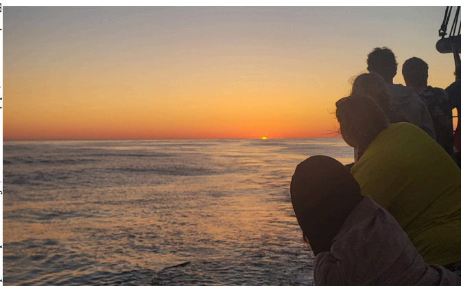
Trainees watching a sunset from on board